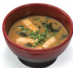
みそ汁 Miso soup