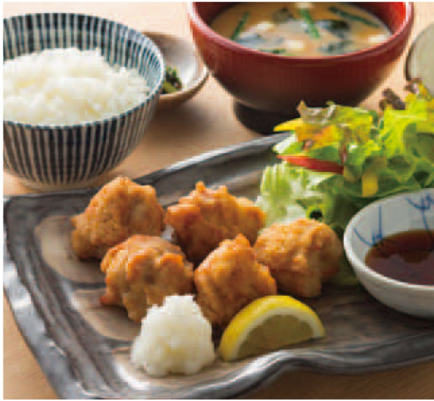
KARA AGE TEISHOKU から揚げ定食 Japanese deep-fried chicken