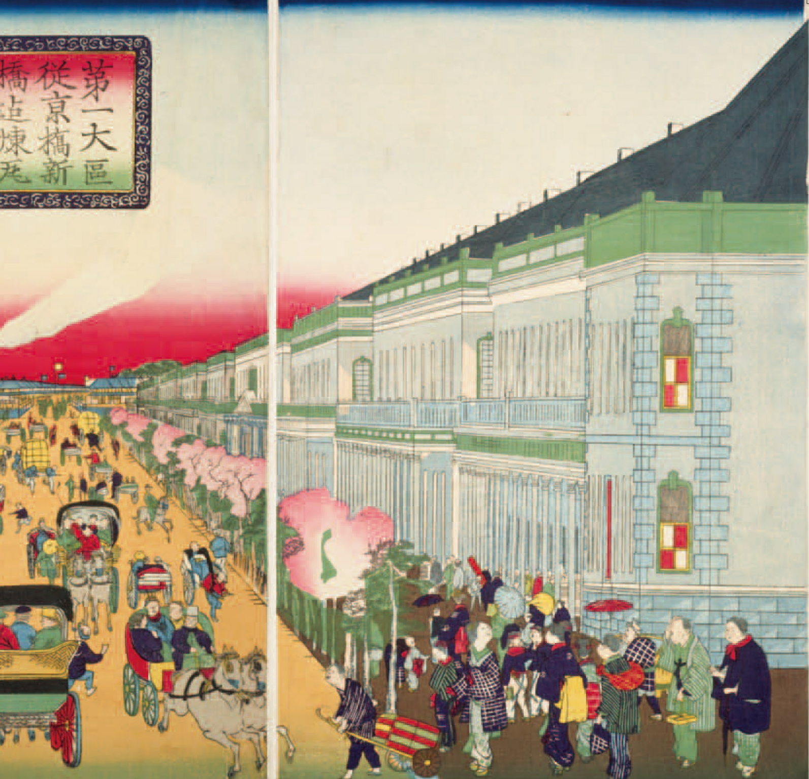
從京橋新橋迄煉瓦石造商家之圖 (日本)

The Meiji restoration opened Japan to the world.