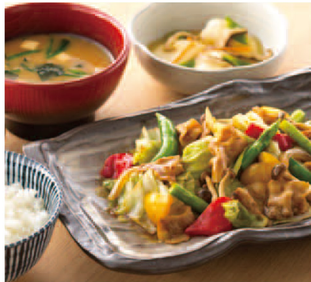
NIKU YASAI ITAME TEISHOKU 肉野菜炒め定食 Stir-fried assorted vegetables with pork belly slices