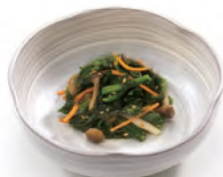
副菜 Side dish