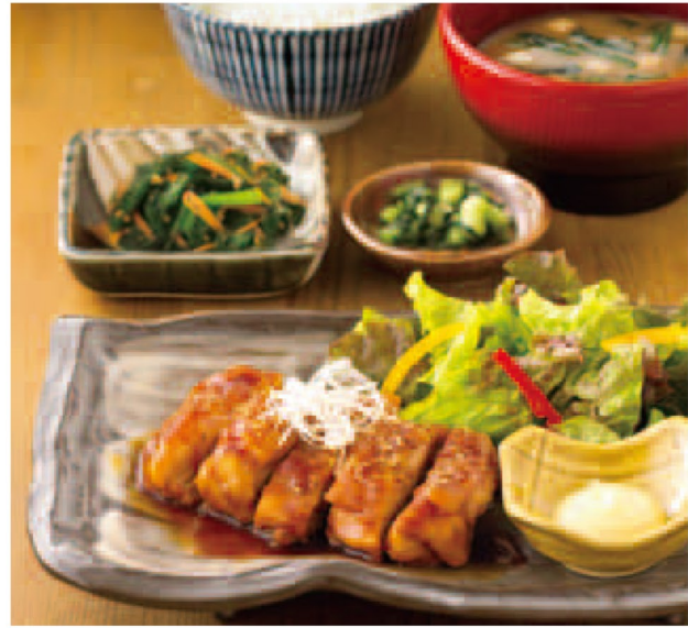
TERIYAKI CHICKEN TEISHOKU 照焼きチキン定食 Chicken steak in teriyaki sauce