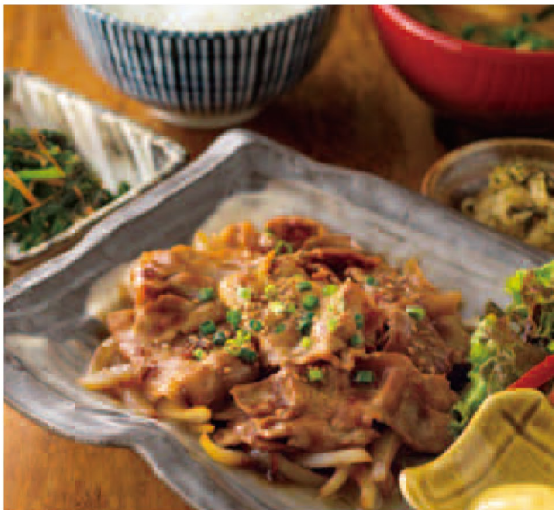
SHOGA YAKI TEISHOKU しょうが焼き定食 Stir-fried pork belly slices in ginger sauce