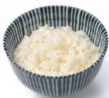
ご飯 Steamed rice